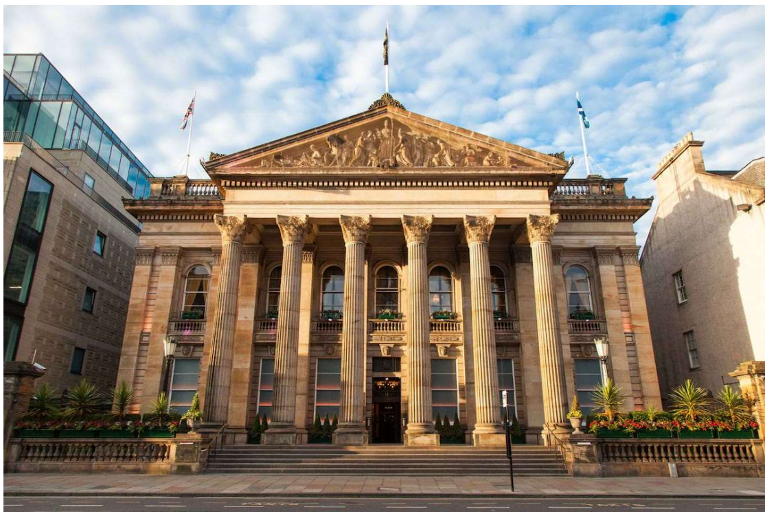
The venue that hosted PEACOC promotional event in UK

The UK PEACOC promotional event took place at The Dome (Charlotte Suite) in Edinburgh on 29 th August 2022. The event attracted 16 participants.